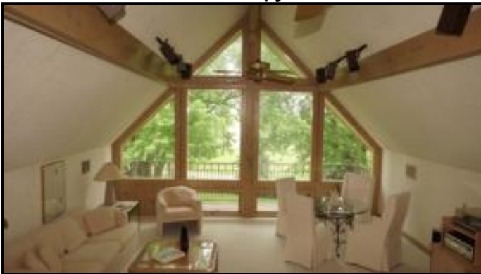
20 - Copy