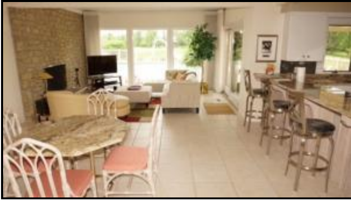
12 - Copy