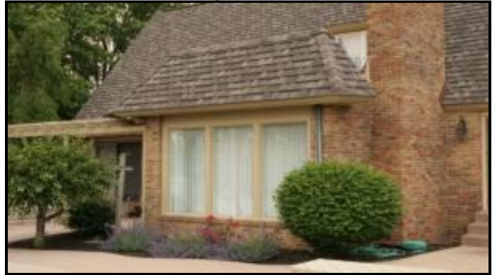
22 - Copy