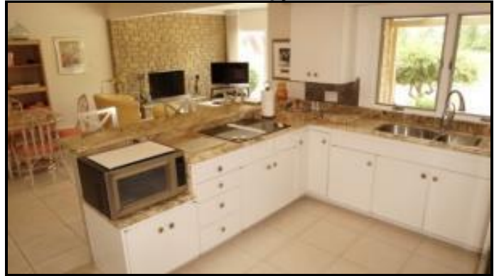
17 - Copy