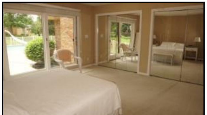
11 - Copy