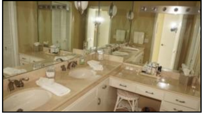
14 - Copy