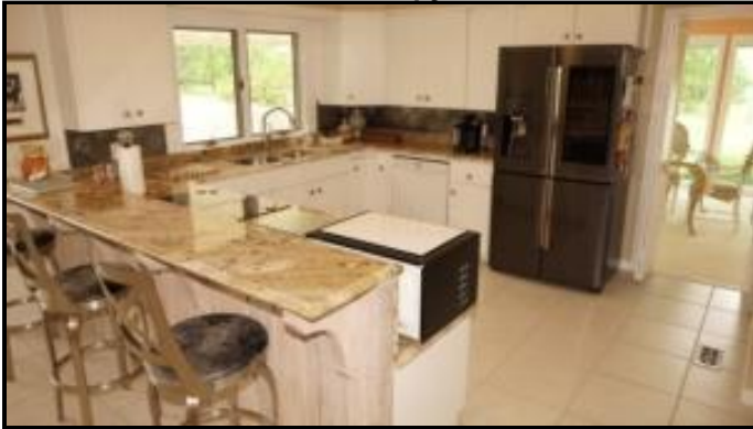
16 - Copy